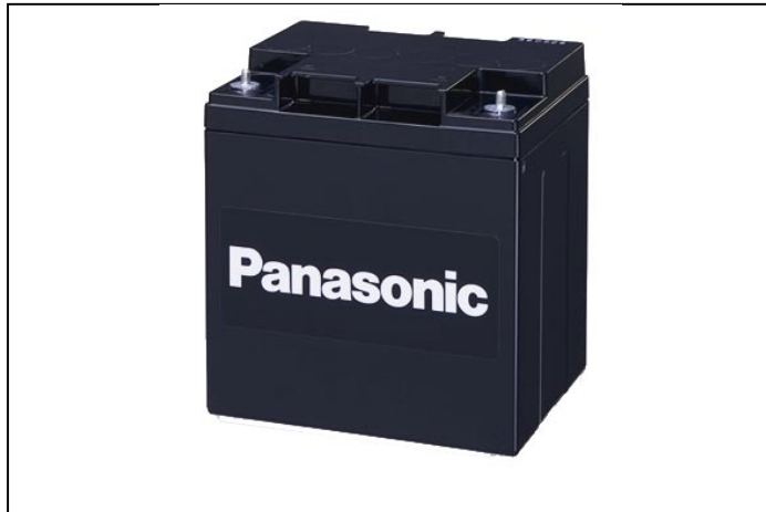
(a) The photo and dimensions represent LC-XC1228AP

For main power supplies. Cycle long life type.